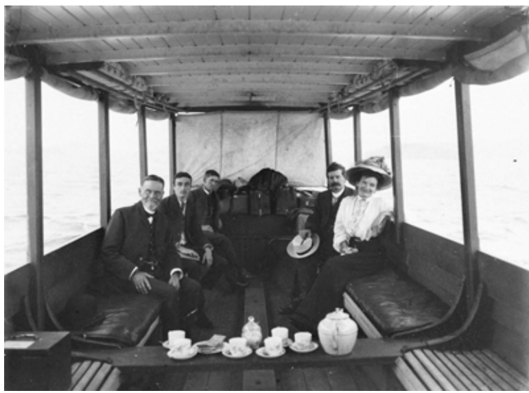
This group, photographed by the Government Tourist Bureau in 1909 was enjoying afternoon tea while cruising Myall Lakes on the launch Replica. GPO Collection, SLNSW

After the tourists had covered the 67-mile tour of the Myall Lakes from Tea Gardens to Bungwahl, Godwin's coach was waiting to carry them a further eight miles to his Accommodation House overlooking Smiths Lake at Bungwahl. Travelling further via Charlotte Bay Creek, they enjoyed the picturesque drive that skirts the shores of Smiths and Wallis Lakes on the way to Cape Hawke or Forster-Tuncurry. With some changes, this road is now the Lakes Way.<sup>3</sup>