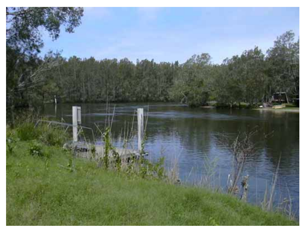
This bend in the Myall River leads to Tamaboi, the narrow reach that is the premium position for catching prawns as they move out of the Broadwater Lake on their way to the sea to spawn. Most of the fishermen who chased the prawns built huts here where they stayed during the best prawning times and stored their gear. Prawning in the area now covered by the Myall Lakes National Park started in the 1920s.