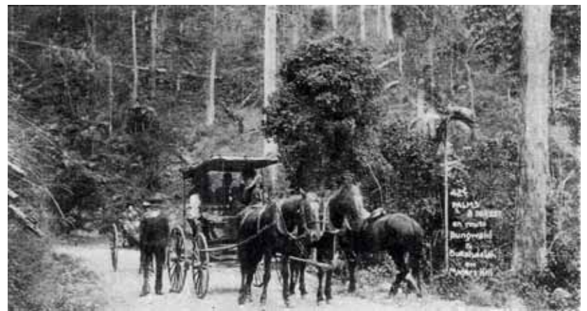
Coaches carry the tourist party up one of the steep hairpin bends on Mayers Hill between Bulahdelah and Bungwahl on the way to Forster. 'The Great Lakes Route: Port Stephens'

The tourists who chose to travel by sea took the modern Newcastle and Hunter River Steamship Company's TSS Karuah with two-berth cabins, saloon dining and electric light. This vessel left Sydney at 6 pm every Tuesday or 3 pm every Saturday and arrived in Nelson Bay at dawn after calling in at Newcastle. On the lakes themselves the steamship company offered the express passenger motor launch Myall and the cargo steam launch Grace but there were many other passenger boats offering their services.