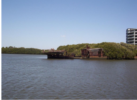
Shipwrecks near Homebush Bay