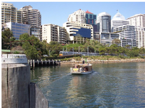
Our vessel, 'Reliance', leaving Lavender Bay