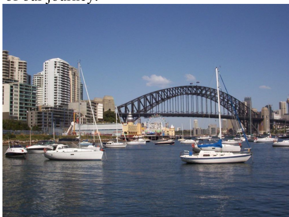
Picturesque Lavender Bay