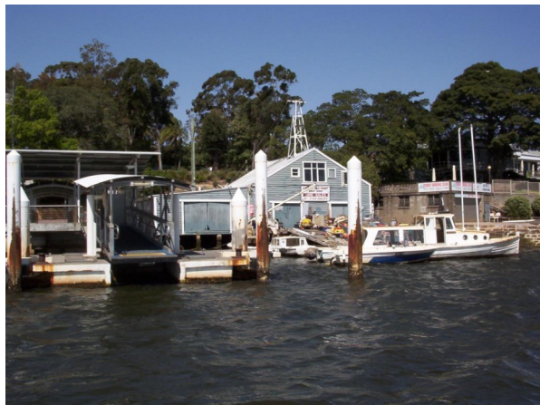
Boatshed at Abbotsford Point

Several boat building sites have lined the foreshores of the harbour and rivers since the earliest days of settlement. One of the major boat builders was Halvorsens, who owned many sites, and are perhaps best known as the builders of some of Australia's early America's Cup contenders, including Dame Patty and Gretel .