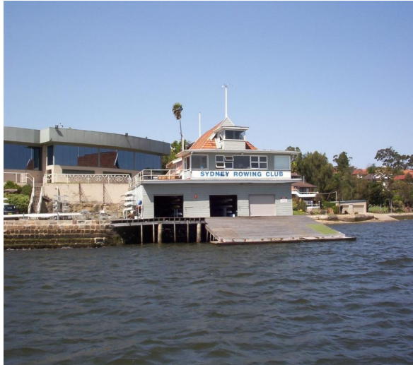
Sydney Rowing Club, Abbotsford

Rowing or sculling has been a popular activity on the rivers since the 1880s and the sport produced Australia's first world sporting champions. On this trip we came across two memorials to scullers. The first, near Abbotsford was raised by public subscription for a sculler named Beach, a fisherman from the Illawarra, who won a local match against a world champion. The second, near Henley is for Henry Searle, an early world champion who died on his way back to Sydney after competing in England. Thousands of spectators lined the foreshores and streets for his funeral procession. The story is a timely parallel with the very public demonstration of grief following the recent deaths of Steve Irwin and Peter Brock.