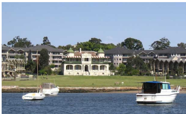
The Nestlé Site on the Parramatta River.

Callan Park is always a delightful and historically interesting setting for this annual event. There are regular guided tours, booked out for history week, but some spaces in the months ahead