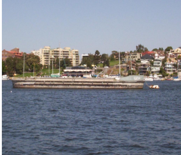
'Dolphins' or floating wharves

These platforms or 'dolphins' near Iron Cove are individual floating wharves that were originally used for unloading logs from ships bringing timber from the Americas and Asia. After unloading, the logs were then towed to Blackwattle Bay.