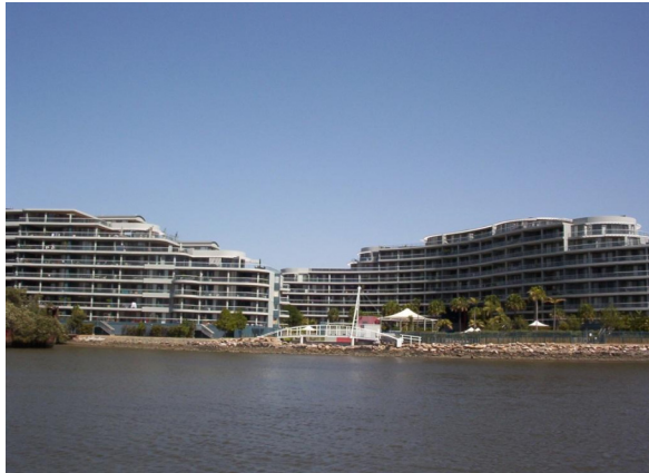
Progress?? New residential developments at Homebush Bay

As we neared our final destination, Homebush Bay, another revelation (to me, at least) was the existence of wrecks in the Bay, which are exposed at low tide. There's also a wildlife refuge here.