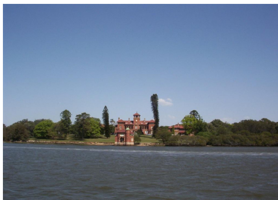
Thomas Walker Hospital, Concord