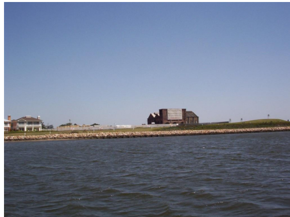
One of the few remaining buildings from AGL's site at Mortlake, or 'Breakfast Point' as it's now known.

Industrial sites have played a major role in the Parramatta River's history. Some of the companies that operated along or close to the River included: Bushells, Wunderlich, Brothers' Paints, Nestle, Meggitt's Linseed Oil, Shell Oil and its earlier incarnation, shale oil and kerosene distillers; and of course, the Australian Gas Works site near Mortlake. While some remnants of earlier industrial activities are still visible, most have been overwhelmed by residential development.